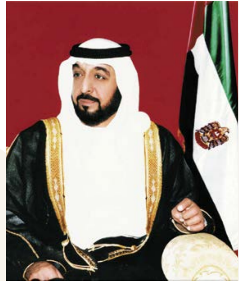
H.H. Sheikh Khalifa Bin Zayed Al Nahyan President of the United Arab Emirates